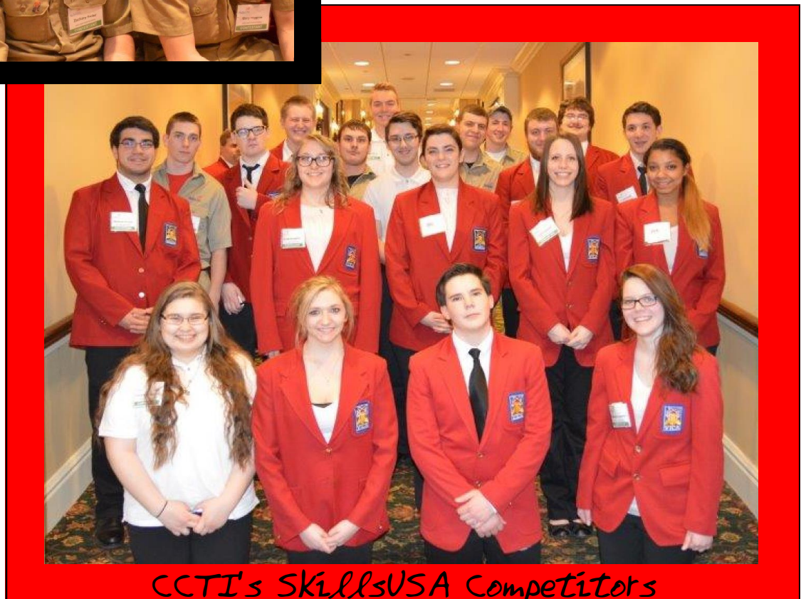
CCTI's SkillsUSA Competitors